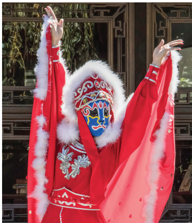
Sichuan Opera (Face Changing) performance at the Autumn Moon Festival

Learn more at WWW.LANSUGARDEN.ORG/AUTUMNMOON